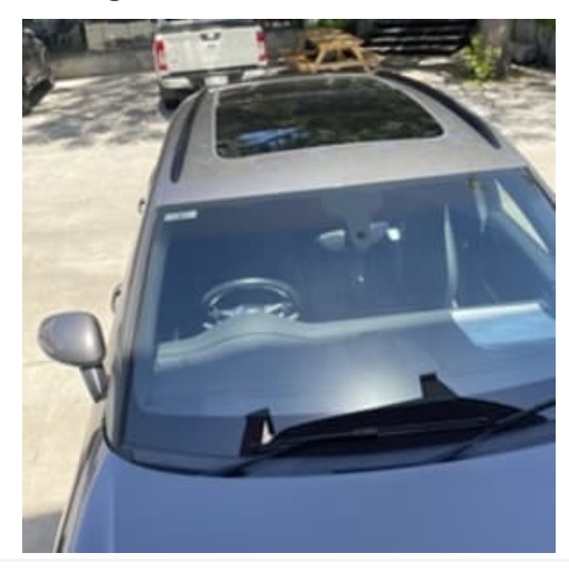
Paint depth discrepancies