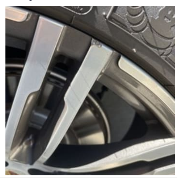
Diagnostic scan [ADD FAULTS TO NOTES]