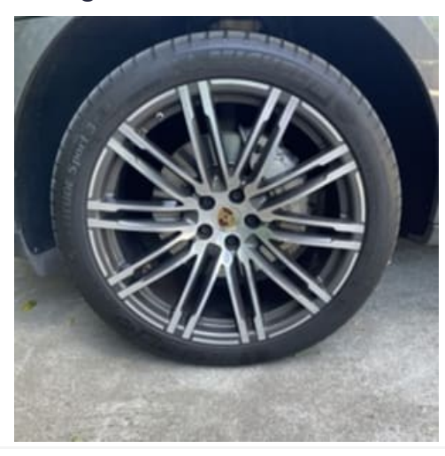
LHR rim condition