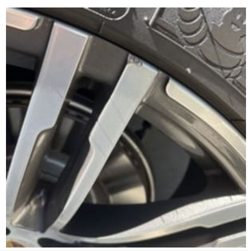
RHF rim condition