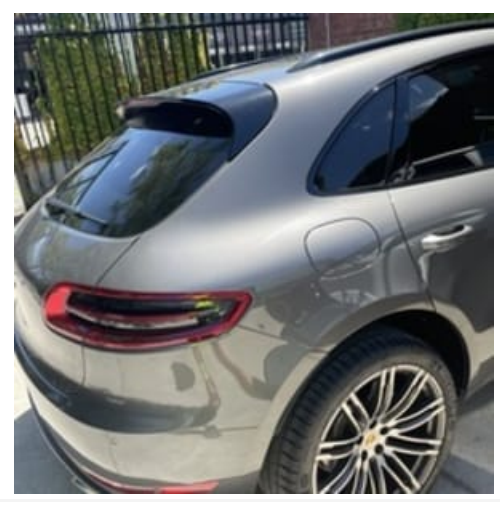
3/4 LH rear panel