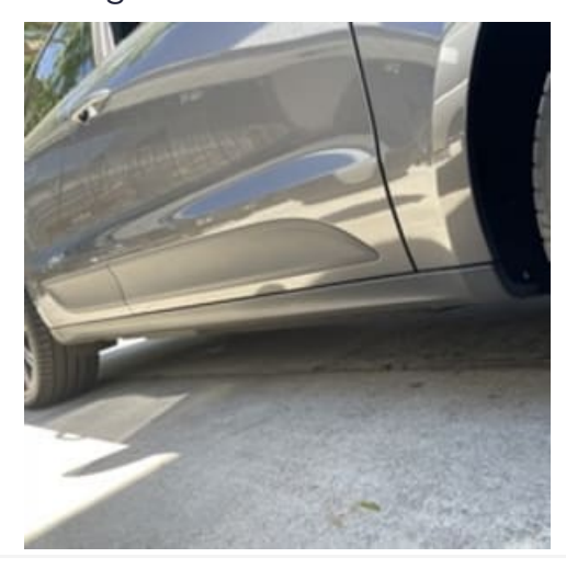
3/4 RH rear panel