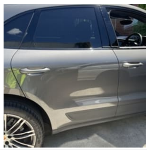
LH Side skirt